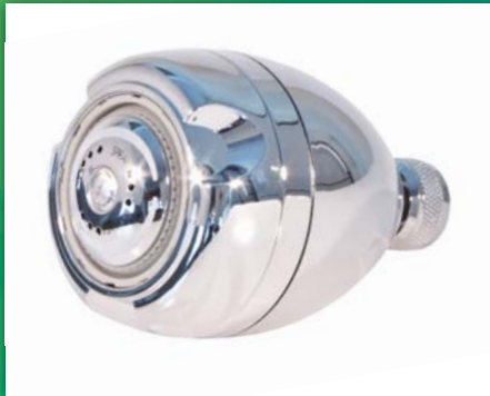
Energy Efficient Showerhead 9 - 10 litres per minute