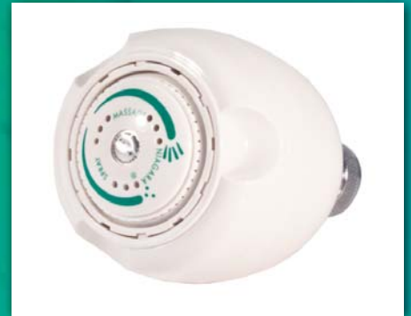
Energy Efficient Showerhead 9 - 10 litres per minute