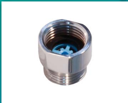
Shower / Tap Water Restrictor 3 - 16 litres per minute