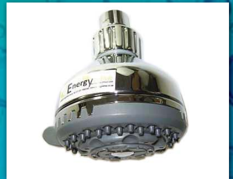
Energy Efficient Showerhead 9 - 10 litres per minute