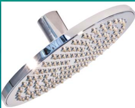
Energy Efficient Showerhead 9 - 10 litres per minute