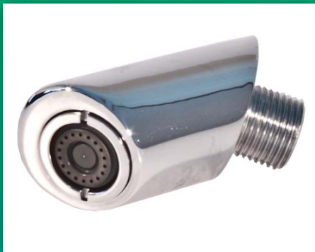
Vandal Resistant Showerhead 9 - 10 litres per minute