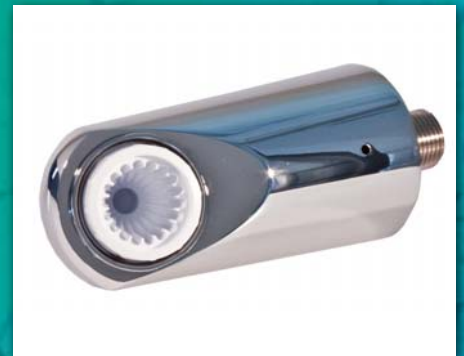
Vandal Resistant Showerhead 9 - 10 litres per minute