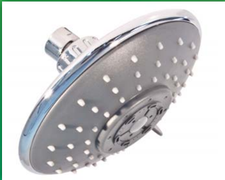
Energy Efficient Showerhead 9 - 10 litres per minute

Below are some of the products selected for the project. Actual showerheads may differ, depending on each site's requirements.