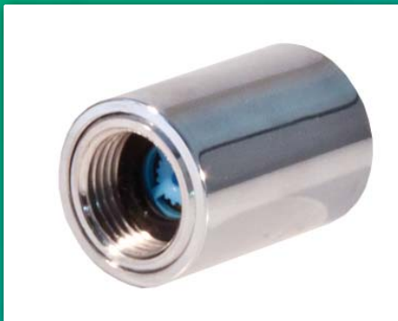
Vandal Resistant Showerhead 9 - 10 litres per minute